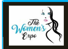
EXHIBIT SERVICE KIT TownSquare Media / Great Falls The Women's Expo 2023 September 29-October 1